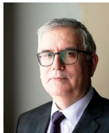
Vladimir Knyagin Vice Governor of St- Petersburg, to be agreed