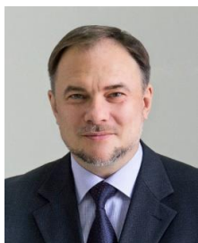
Dmitry Afanasyev Deputy Minister of the Ministry of Science and Higher Education to be agreed