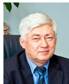
Anatoly Kotov Special representative of the Governor of SPB for economic development to be agreed