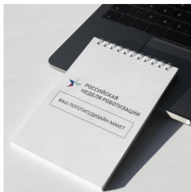
Branding of participant's notepads exclusive package