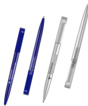
Branding of participant's pens exclusive package