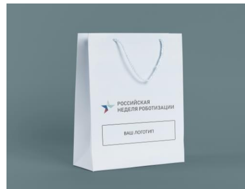
Branding of participants' bags exclusive package