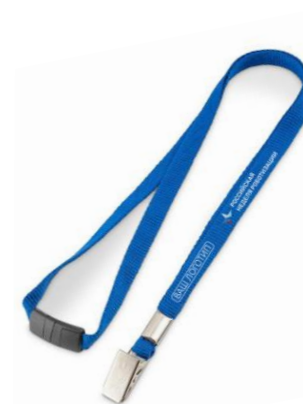
Branding of ribbons for participants' badges exclusive package